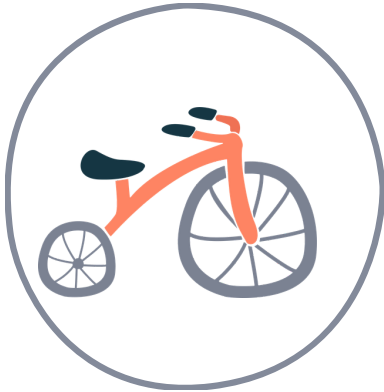
Ride a bicycle

Do an outdoor activity and check off what you have done!