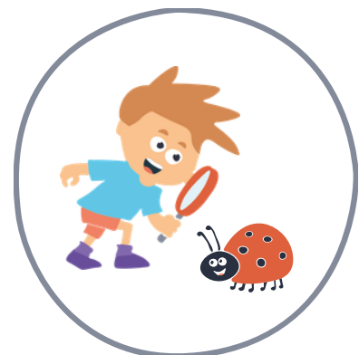
Looking for insects