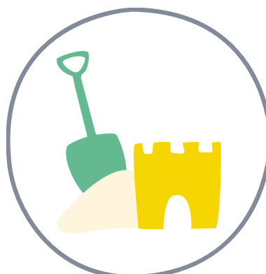
Making a sandcastle