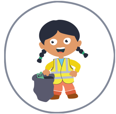
Cleaning up the neighborhood